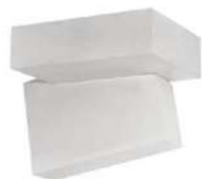
392 Bianco / White