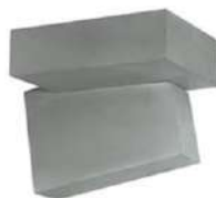
395 Grigio / Grey