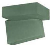
393 Verde / Green