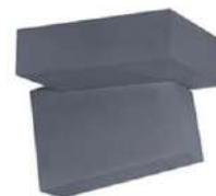
396 Nero / Black