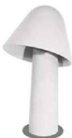
392 Bianco / White