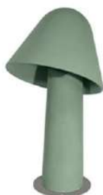
393 Verde / Green