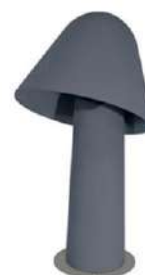
396 Nero / Black