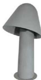
395 Grigio / Grey