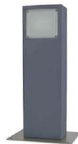
396 Nero / Black