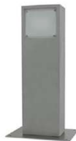
395 Grigio / Grey