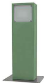
393 Verde / Green