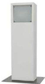
392 Bianco / White